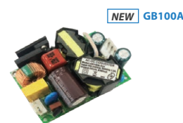
3" X 2" Miniature Size