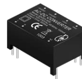
AC/DC power module