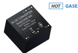
1" x 1" Package