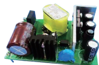
25 Watt Open Frame